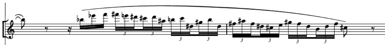
Example 6a: Carl Nielsen, Flute Concerto , mm. 58-59.

There are a number of similarities between the woodwind parts in the wind quintet, flute concerto, and clarinet concerto. For example, the lyrical melody in measure 62 in the second movement of the flute concerto is similar to the Adagio melody in the clarinet concerto in rhythm, style, and pitch content. In measure 58 of the first movement of the flute concerto, the flute has a technical passage that is similar to the triplet figure in rehearsal number 32 of the clarinet concerto. In both cases, Nielsen begins the run on a quick duple pick-up that leads into a fast set of triplets (see Examples 6a and 6b).