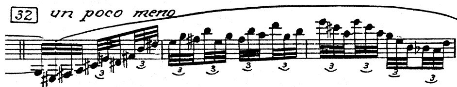
Example 6b: Carl Nielsen, Clarinet Concerto , rn. 32

The variations in the third movement of the wind quintet are comparable to the writings in the two concerti as well. For example, Variation V features a raucous clarinet line that looks and sounds like it could have been composed for the clarinet concerto. It is rhythmically complex, fast-moving, and employs the full range of the instrument (see Example 7).