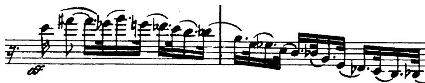
Example 7: Carl Nielsen, Wind Quintet , Movement 3, Variation V, mm. 3-4

The variations in the third movement of the wind quintet are comparable to the writings in the two concerti as well. For example, Variation V features a raucous clarinet line that looks and sounds like it could have been composed for the clarinet concerto. It is rhythmically complex, fast-moving, and employs the full range of the instrument (see Example 7).