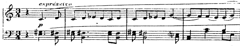
Example 1: Carl Nielsen, Clarinet Concerto , mm. 210-213