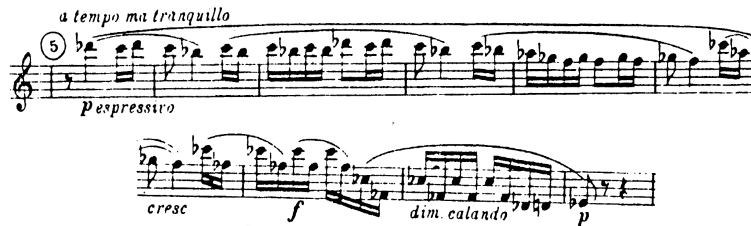
Example 3: Carl Nielsen, Clarinet Concerto , mm. 79-88