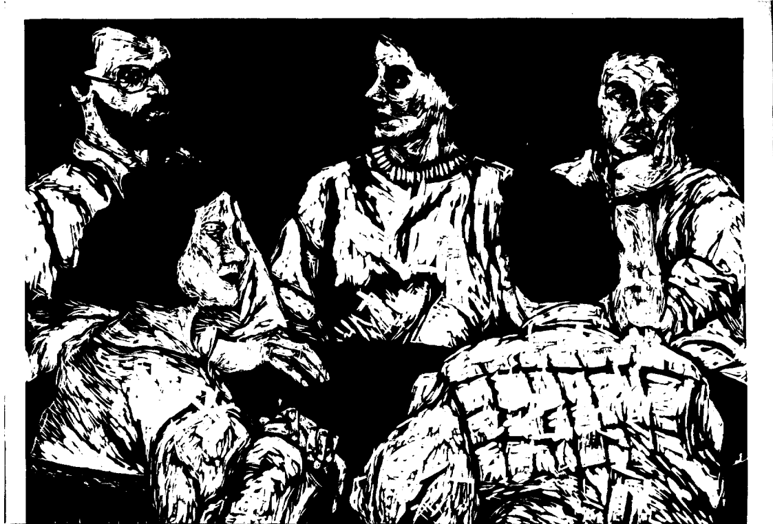
Title: The Dinner Party Medium: Woodcut Size: 30" x 42"