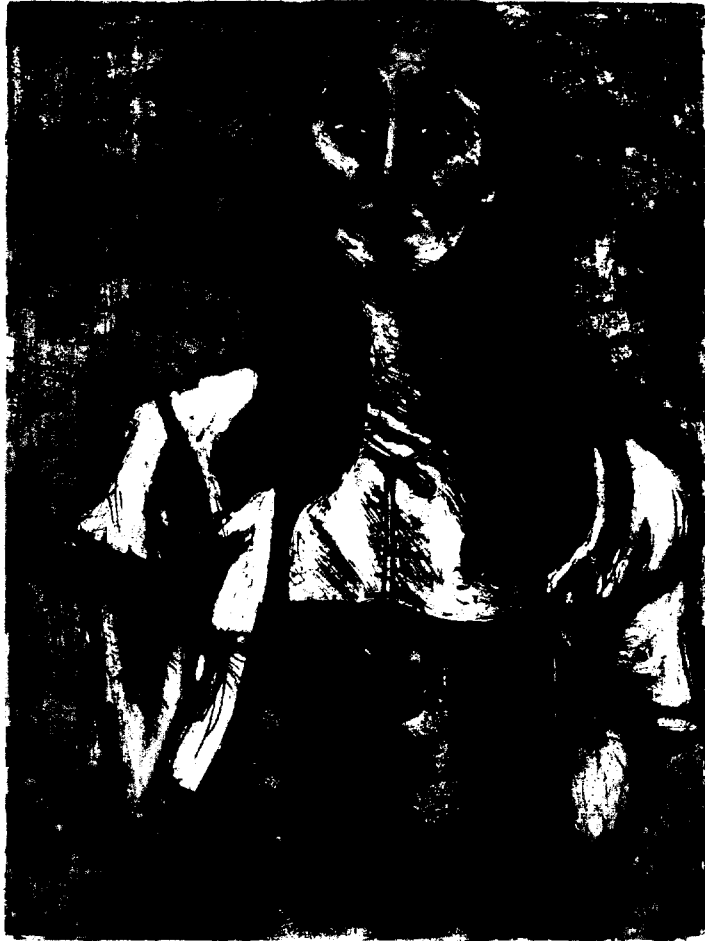
Title: Debutante Medium: Intaglio and Woodcut Size: 24" x 18"