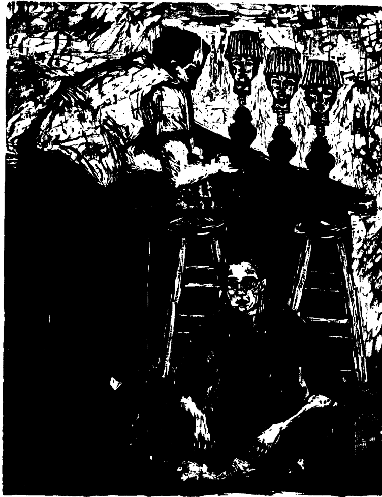
Title: Being It All Medium: Woodcut Size: 31" x 24"