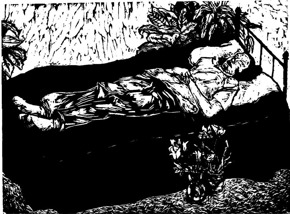
Title: Only the Lonely Medium: Woodcut Size: 24" x 32"