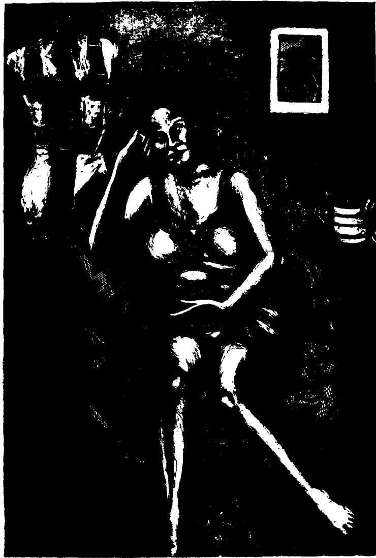
Title: The Birdcage Medium: Intaglio Size: 36" x 24"