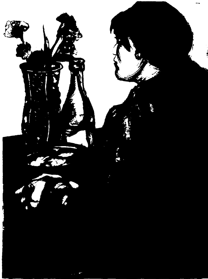
Title: Empty Plate, Full Stomach Medium: Intaglio Size: 24" x 18"